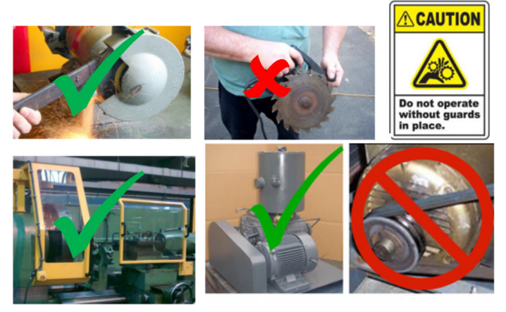
Never tamper with or removed guards from any equipment or tool.

Any machinery or equipment that has moving parts that could come in contact with any part of your body must have guards or other control measures installed to prevent contact. If you are uncertain about guards or other safety features for any equipment you are operating, contact your client supervisor and Workforce branch immediately and don't operate the equipment until these safety requirements are confirmed.